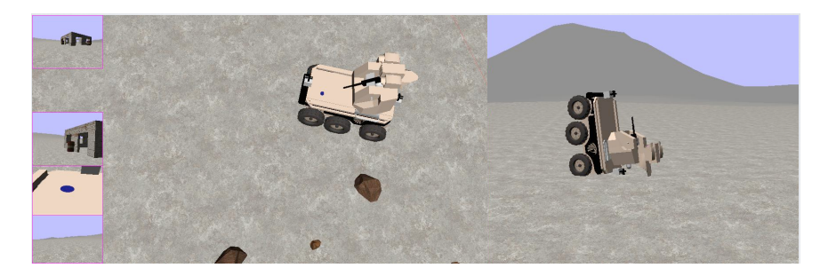
Fig. 2. Safety issues: LandShark shoots itself and tips over