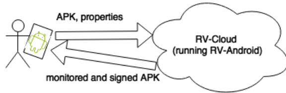
Fig. 2: RV-Android On-Device Architecture